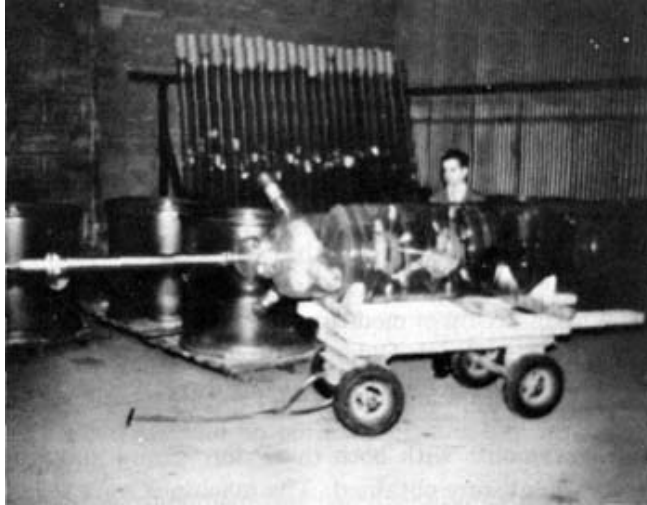
The large, special, phase-conjugating plasma tube for Priore's giant device. The final machine would have treated humans "whole-body."